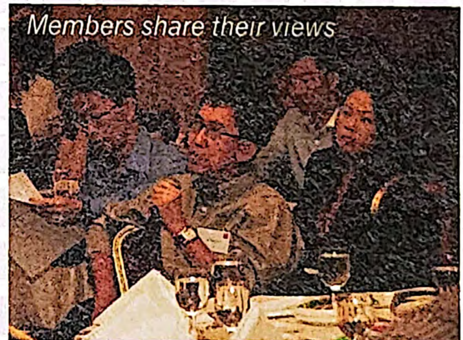
Members share their views