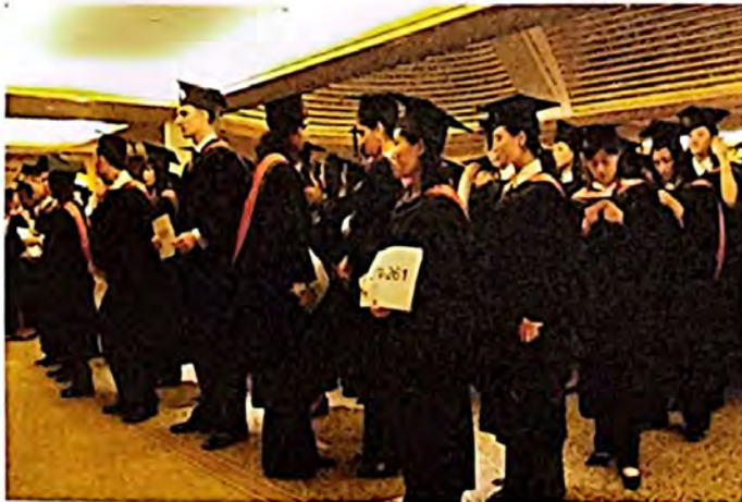
Graduates of the December 2003 examinations prepare to make their grand entrance.