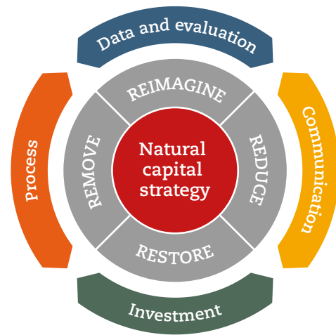
FIGURE 2: Natural capital strategy