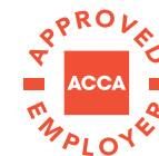
Trainee Development - Platinum