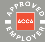
Practising Certificate Development