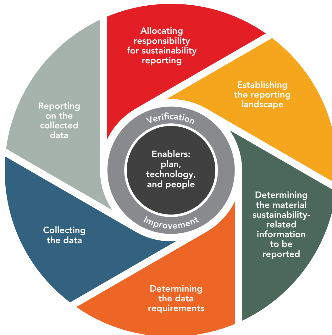
The sustainability reporting cycle

An organisation will usually engage with the cycle in a clockwise flow. Working on one stage may necessitate considering another stage or parts within a stage. For instance, new information discovered when collecting data for reporting may prompt the organisation to revisit the identification of sustainability-related risks and opportunities (SRROs) that could reasonably be expected to affect the organisation's prospects.